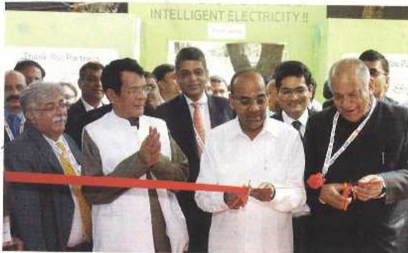
From L to R) Shri Tanga Byeling Chairman, North Eastern Regional Power Committee, Minister for Home, Power & Non-Conventional Source of Energy, Arunachal Pradesh, Shri Anant Geete, Union Minister for Heavy Industry & Commerce, Government of India and Shri Vishnu Agarwal, President, IEEMA cutting the ribbon of INTELLECT 2015 exhibition