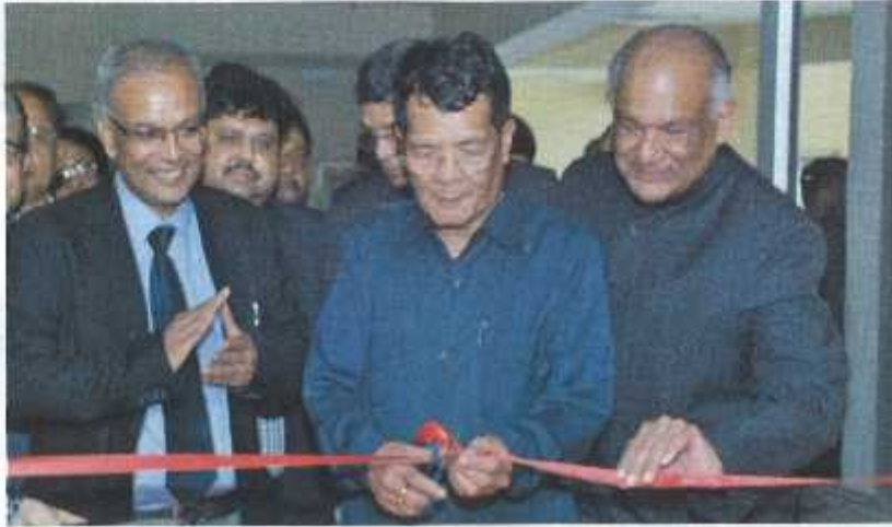
Shri Tanga Byaling, Minister of Home, Power and Non-Conventional Source of Energy, Andhra Pradesh inaugurating the Konnect North-East & Beyond Summit