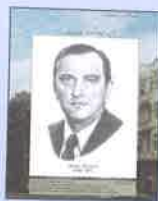
Stefan Banach (1892–1945)